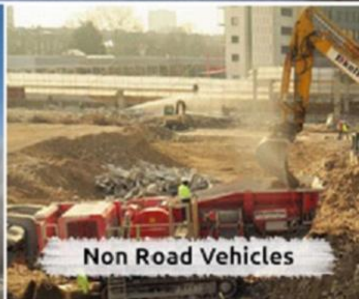
Non Road Vehicles