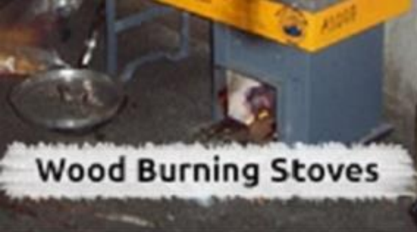
Wood Burning Stoves