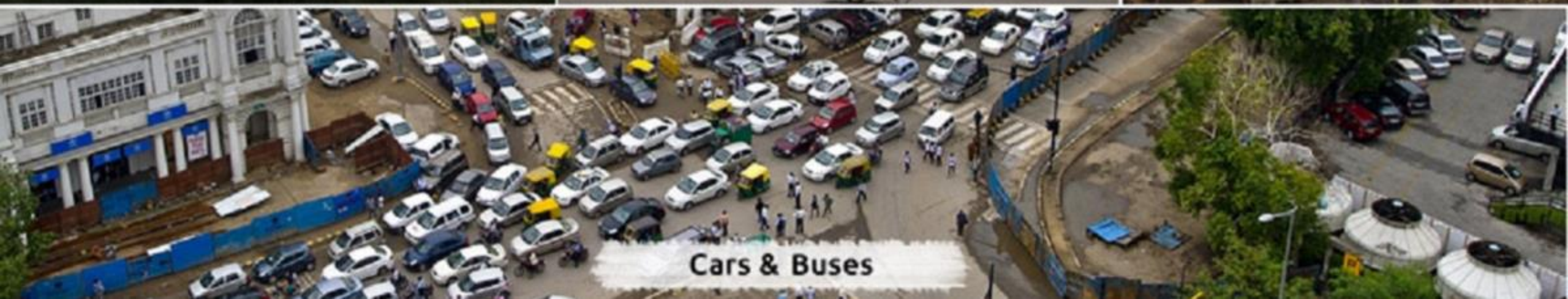
Cars & Buses